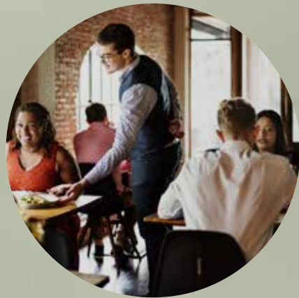
HOTELS & RESTAURANTS