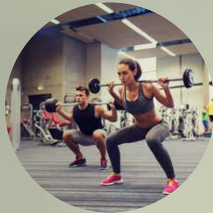
PHYSICAL FITNESS ARENA